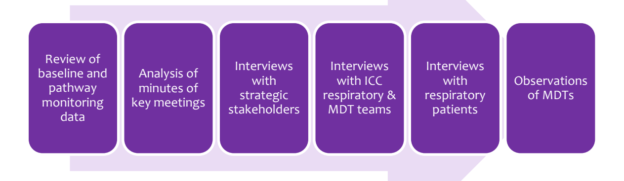
Figure 3: Summary of Year 2 Data Collection

Further details on each of these planned activities and our progress against each is summarised in Table 1 below.